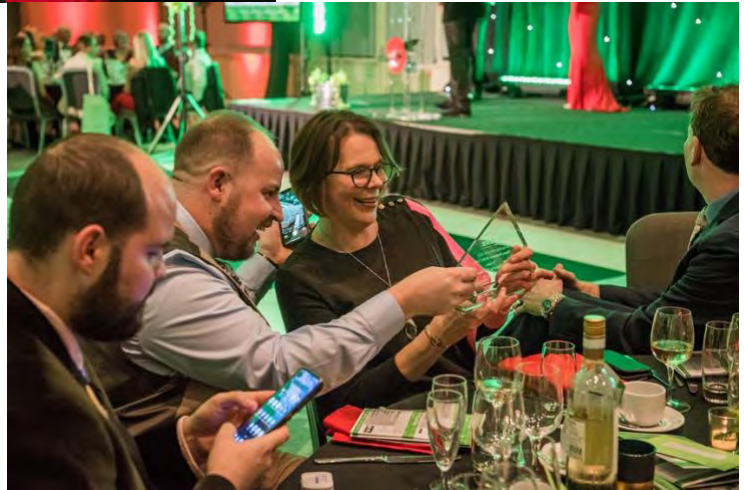
The Hive & Off the Wheaten Track